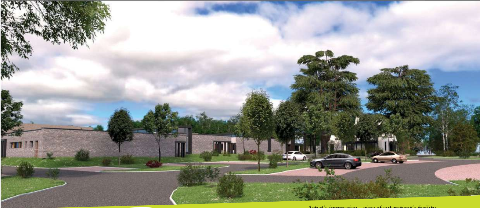
Artist's impression - view of out-patient's facility with the Aske House in the background.

Plans have been announced for the development of a world class specialist facility that will provide a unique and accessible range of transition pathways for individuals with SPMLD seeking to successfully move from congregated to community settings.